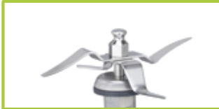
Pisau pengaduk (tajam)