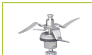
Mixing knife (sharp)