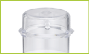
Measuring cup (MC)