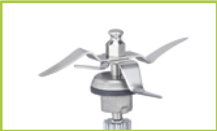
Mixing knife (sharp)