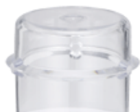
Measuring cup (MC)