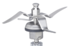
Mixing knife (sharp)