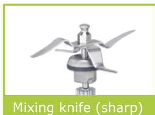
Mixing knife (sharp)