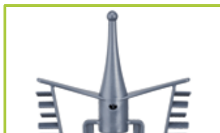
Mixing tool Butterfly