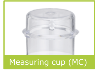
Measuring cup (MC)