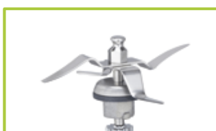
Mixing knife (sharp)