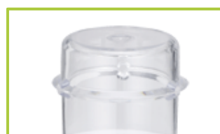
Measuring cup (MC)