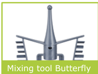
Mixing tool Butterfly